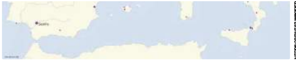
Printing places of incunabula (i.e. published volumes) showing the spread of printing in the 15th century. 271 locations are known. The data is based on the Incunabula Short Title Catalogue of the British Library (as of March 2, 2011).

So where did this witch stereotype come from? Scholars point to the traveling friars in the Valais area of the Swiss Alps in the 1420s, who had been dispatched to combat heresy. As they traveled from town to town in this mountainous region at the intersection of Germany, France, and Switzerland, these preaching friars absorbed and transmitted popular fears. Eventually, they brought word back to religious and secular officials who documented these stories.