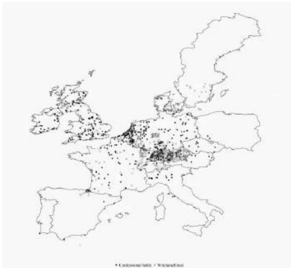
Confessional-Battle and Witch-Trial Activity Geographically, 1300-1850.

Meanwhile, in Catholic strongholds—where Inquisitors were busily persecuting “heretics”—witches were mostly ignored. The infamously savage Spanish Inquisition executed no more than two dozen alleged witches; Portugal put to death around seven.