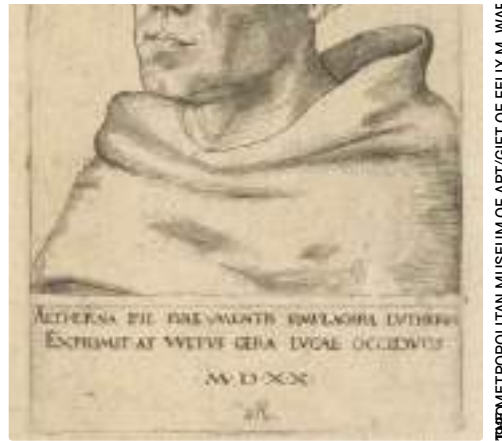
Martin Luther engraving made by Lucas Cranach the Elder in 1520.

By nailing his Ninety-five Theses to the door of his local Catholic Church in 1517, Luther was acting as an early consumer protection bureau of sorts, blasting the Catholic church for exploitative practices. The promise of superior religious service sparked the Protestant Reformation, with Swiss theologians Ulrich Zwingli and John Calvin piling on, adding to the movement's momentum.