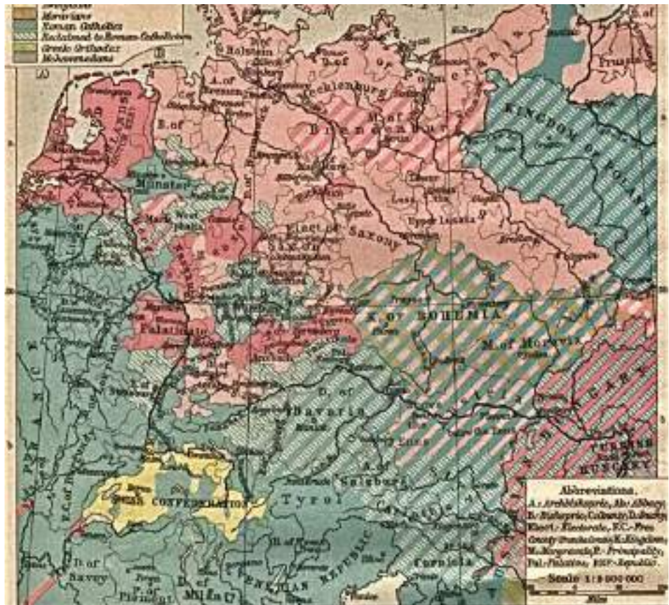
The Religious Situation in Central Europe about 1618.